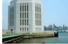
Brooklyn-Battery Tunnel Ventilation Building