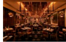
Park Avenue Restaurant