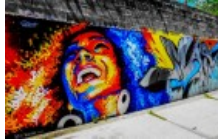
Brooklyn Graffiti II